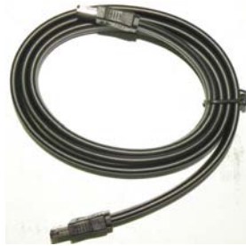
ESATA cable * 1