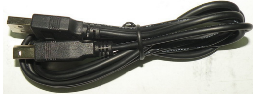
Usb cable * 1