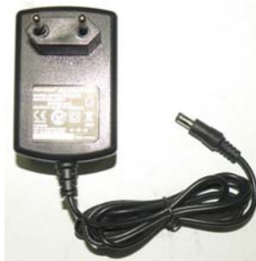
12V / 2A DC Adaptor