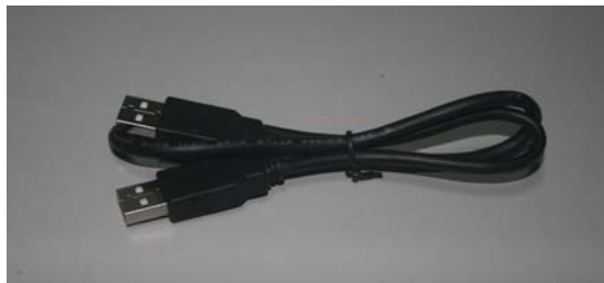
USB adaptorx 1